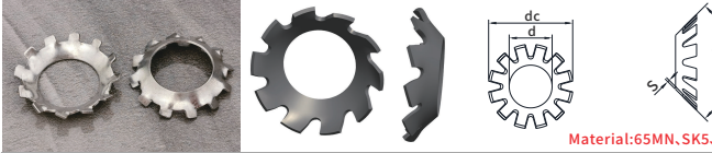
Material:65MN, SK5, SK7, Stainless steel

Part Number Designation JX-GBT9074.28 - D3 - 65MN ↓ Type and Material Material:65MN