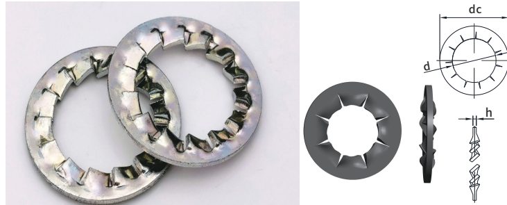
Material:65MN, SK5, SK7, Stainless steel

Part Number Designation JX-QC410 - D2 - 65MN ↓ Type and Material Material:65MN