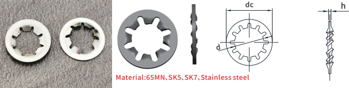
Material:65MN, SK5, SK7, Stainless steel

Part Number Designation JX-GBT861.1 - D2 - 65MN ↓ Type and Material Material:65MN