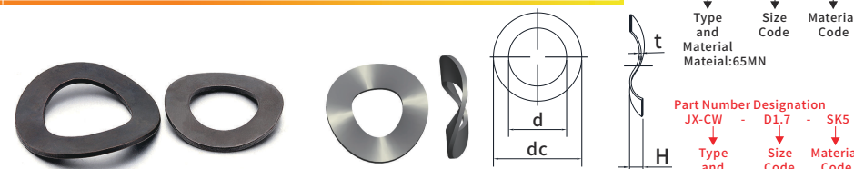
Material: 65MN, SK5, SK7, Stainless steel