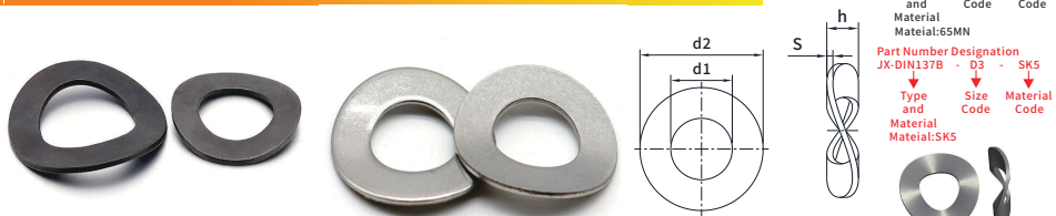
Material: 65MN, SK5, SK7, Stainless steel Unit:mm