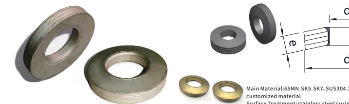
Main Material:65MN,SK5,SK7,SUS304,316(A2,A4)and other special customized material Surface Treatment:stainless steel curing polished original color or spring steel in black,mechanical galvanizing,nickel plating,Decromet coating treatment

Part Number Designation JX-NFE-4L - D6 - 65MN